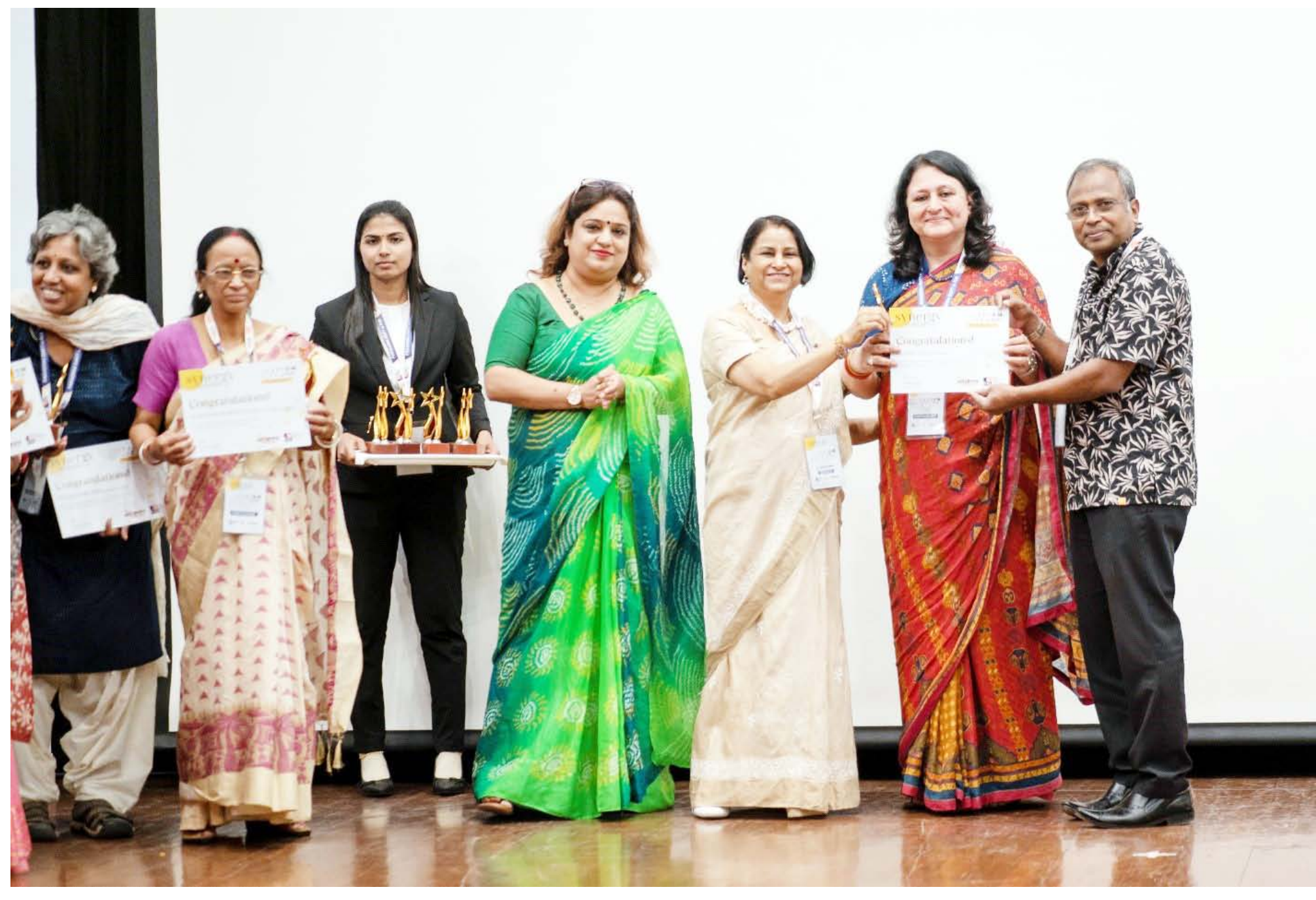
Organizations were felicitated with certificates, gifts and trophies for the FLN work they have been doing in their own domains.