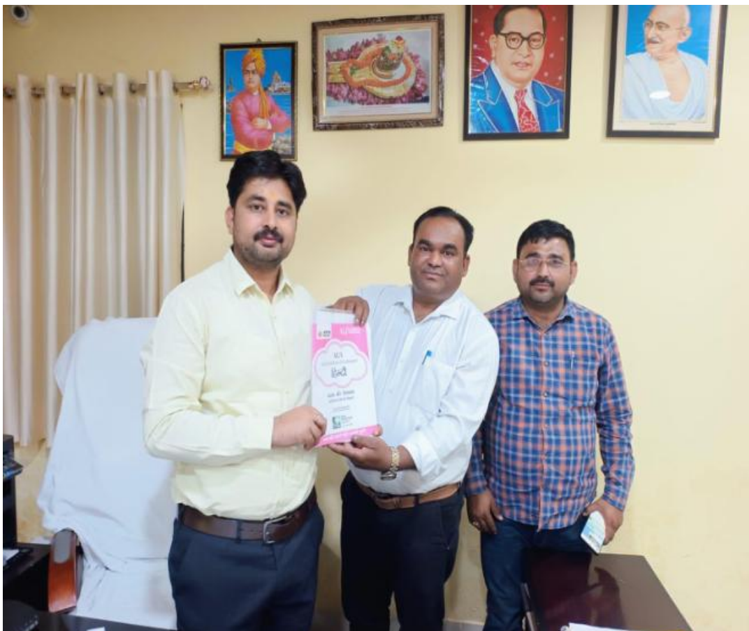
District engagement / MoU